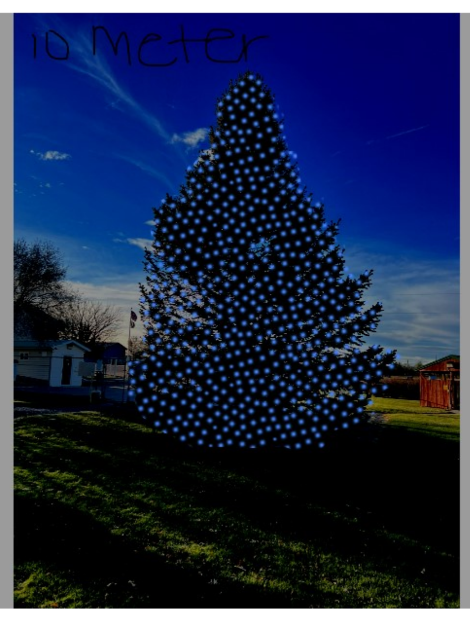
Breanna Ma - Park 2023 (in-creation)