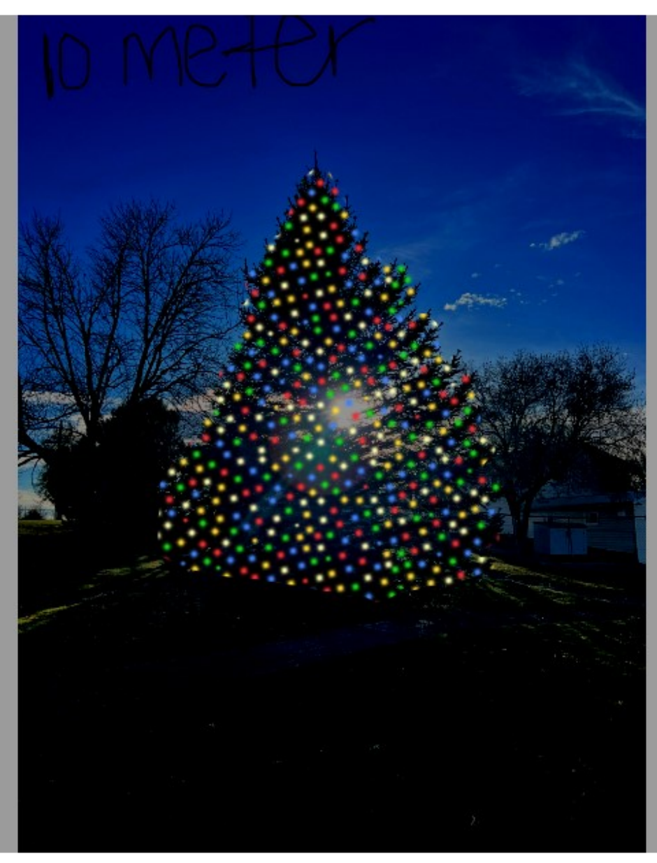
Breanna Ma - Park 2023 (in-creation)